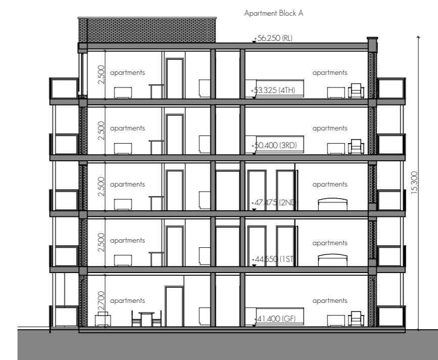
SECTION A-A 1:200